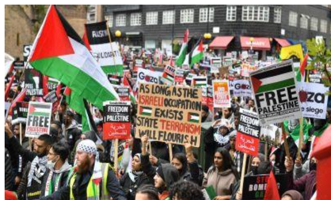
Above: Thousands march on the Israeli embassy in London.

the defence of Palestine. From “Stand with Ukraine” (which in practice meant “Stand with Nazis”), the Ukrainian flags were replaced, overnight, with Palestinian flags, to become “Stand with Palestine”. While it is undeniable that elementary justice is on the side of Palestine, have the Covid/liberal/opportunist left completely changed their stripes? Have they performed a 180 degree turn from de-facto support for imperialism to sharp opposition to imperialism and its wars? Practice indicates otherwise.