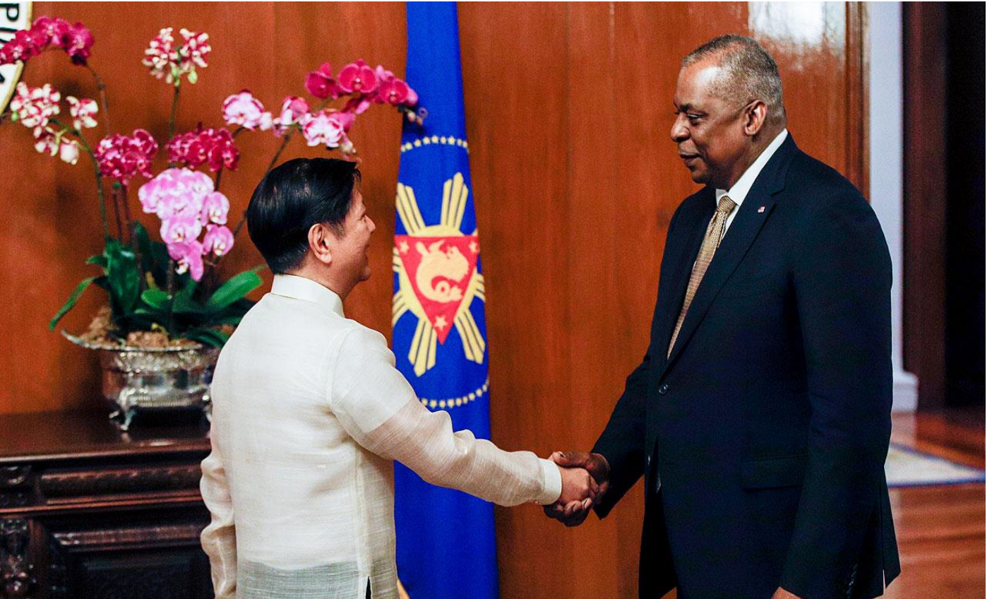
Above: President Ferdinand “Bongbong” Marcos Jr greets US Secretary of Defence Lloyd Austin III at the Malacanang Palace in the Philippines on February 2, 2023.

(Article sourced from www.redfireonline.com )