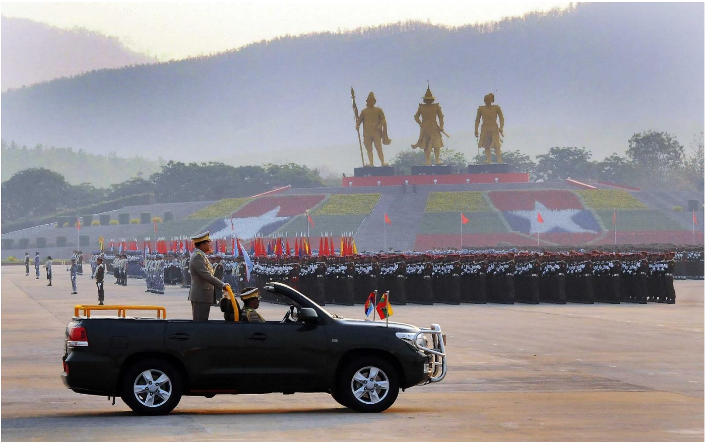
Image: A Tatmadaw (Myanmar military) parade from 2017.

(Article sourced from www.redfireonline.com )