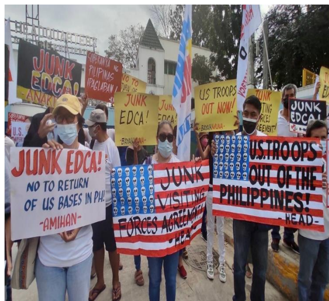
Above: Protests in the Philippines (while wearing facemasks!) against the revived Enhanced Defence Cooperation Agreement (EDCA), which expands the number of US “forward operating bases” located in the Philippines.

the number one trading partner of the Philippines. Over 30% of its exports go to China, while exports to the US and Japan combined make up around 25%. In addition, Philippine imports from China comprise around 33% of the total, while US and Japanese imports together amount to only 14%. 47 In short, the Philippine economy would be sacrificed.