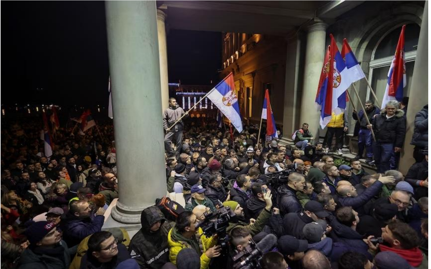
Above: Supporters of the SPN ("Serbia Against Violence") attempt to storm the Belgrade City Hall.

(Article sourced from www.redfireonline.com )