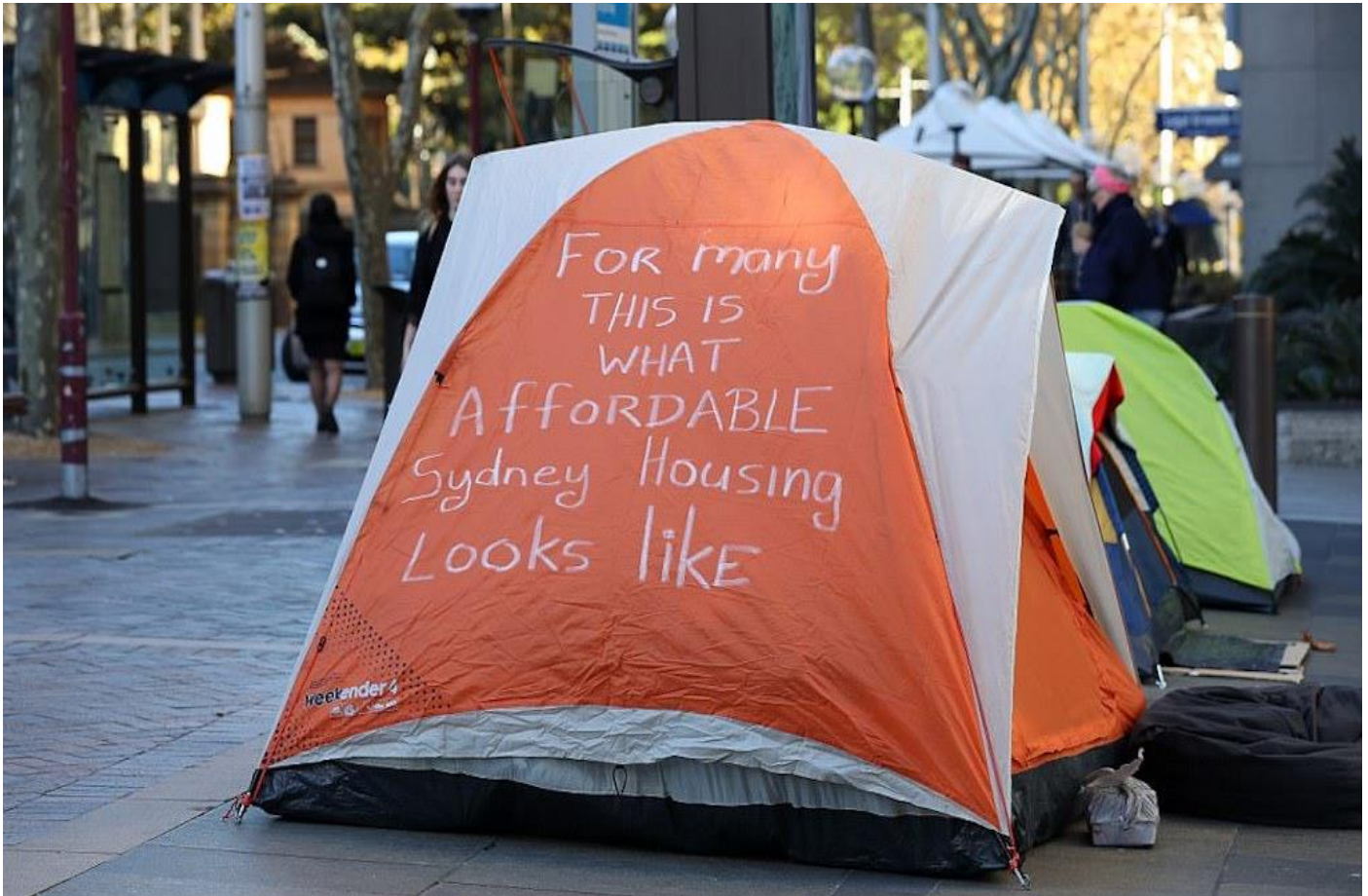
Above: A protest in Sydney's Martin Place highlighting the unaffordability of housing. www.streetsmartaustralia.org

(Article sourced from www.redfireonline.com )