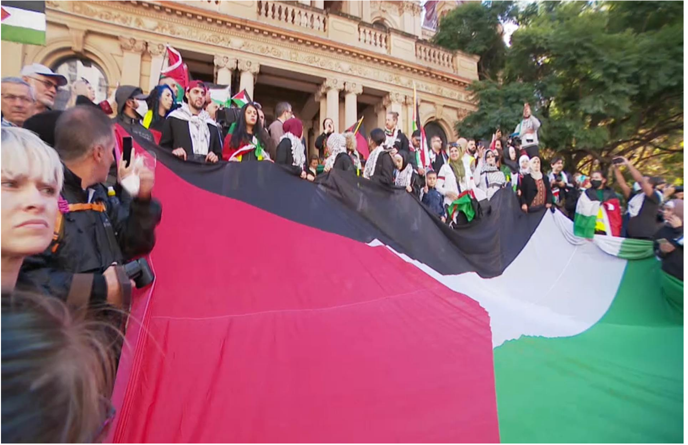
Above: A pro-Palestine action in Melbourne. www.habitattlaut.blogspot.com

(Article sourced from www.redfireonline.com )