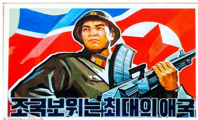
Above: A poster from the DPRK, hailing the role of the Korean People's Army (KPA).

This is the reason why the DPRK is more demonised in the Western media than any other nation. It is subjected to a mountain of lies in order to hide achievements which many consider impossible. The only Western accusation which has some relation to the truth is the existence of a leadership cult around the Kim family. Of the plethora of various forms of Stalinism, this one is the most unique, but it distorts political discourse on the northern side of the Korean peninsula. While credit should be due to leading figures, no genuine militant should tolerate unquestioning adulation of individuals. Despite this, to be able to stare down and resist the dire threat of invasion and/or nuclear annihilation by the Pentagon every day for decades on end, is a remarkable testament to the strength of the DPRK. What is required is the revolutionary reunification of Korea, through a proletarian political revolution in the North combined with a socialist revolution in the South. It is acknowledged that this is likely to be bound up with a proletarian political revolution in the PRC, Korea's giant neighbour. With all due respect to 20 th century Korean and Chinese history, the removal of Stalinism and the consequent extension of genuine Marxism internationally remains key for the final victory of socialism in Asia.