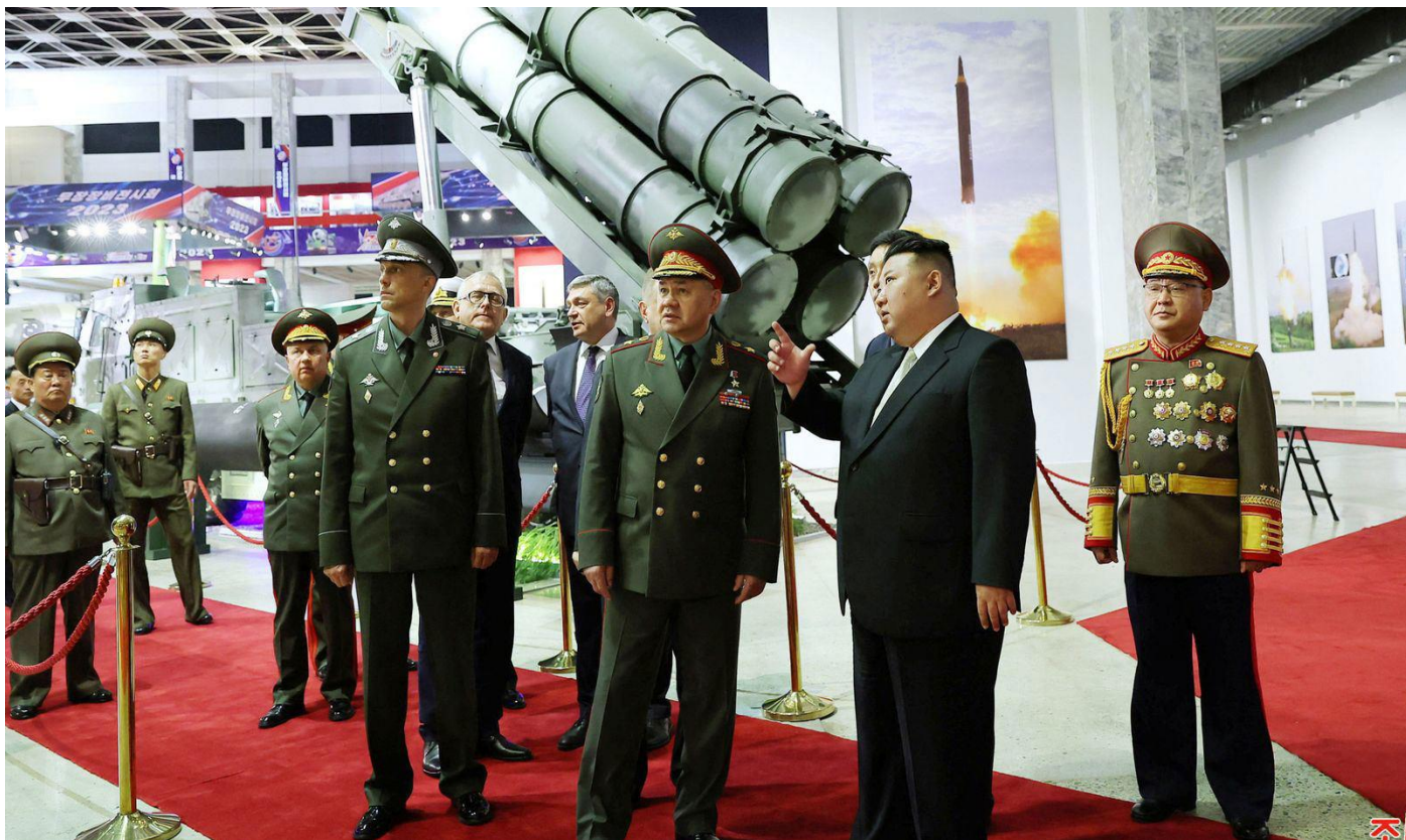
Above: DPRK leader Kim Jong Un shows Russian Defence Minister Sergei Shoigu some of their hardware.

(Article sourced from www.redfireonline.com )