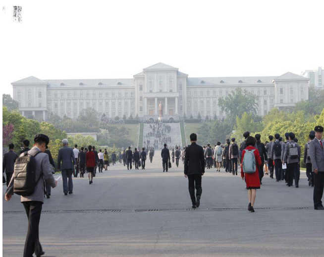
Above: Students in the DPRK attending the Kim Il Sung University. Education is free in the DPRK, as is healthcare and housing, while citizens pay no tax. This is the basic reason why the DPRK is demonised in the Western media, who attempt to bury facts from their audience. www.kkfonline.com

Now, the US ruling class is again trying to provoke a war with nuclear armed Russia via Ukraine. It is mainly through the incredible restraint shown by Russia and the PRC in the face of relentless provocations that World War III has not yet broken out. Despite living under the shadow of ongoing sanctions and threats against it for more than seven decades, the DPRK is still prepared to defend the gains of its century of struggle. The largest gain is the construction of a workers' state , which on an economic basis, is arguably the most advanced socialistic power to have yet come into being. Under the constitution of the DPRK, its citizens have the right to employment (which means zero unemployment), free education, free healthcare and full material assistance in the event of illness. All citizens over 17 years of age have the right to stand and be elected in any of the DPRK's state organs. 121 Astonishingly, housing is free and supplied to all as a basic right. 122 And, all of these benefits come without any burden of taxation. Taxes in the DPRK were abolished in 1974 !! 123