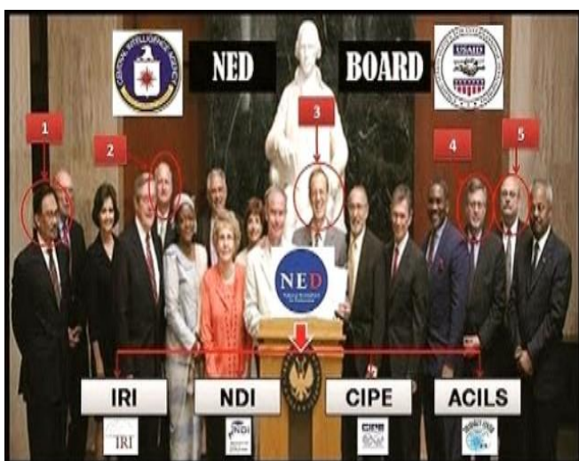
Above: Photo of Anwar Ibrahim (1) with other patrons of the National Endowment for Democracy (NED), the US Congress funded body which works non-stop on regime change operations around the world. It includes subsidiaries such as the International Republican Institute (IRI) and the National Democratic Institute (NDI). The main aim is to break Malaysia's economic, political and cultural ties with the People's Republic of China (PRC). www.kitaanakmelayu.blogspot.com

The New Atlas was quick to remind everyone 141 that despite Anwar Ibrahim's projected image as a fighter against corruption, he has long been a patron of the National Endowment for Democracy (NED) – the regime change arm of the US government's Central Intelligence Agency (CIA). As soon as Ibrahim was released from prison in 2005, he travelled directly to Washington to meet with the NED. When he returned to Washington in 2019, NED head Carl Gershman gave him a glowing introduction as a guest speaker at the annual Seymour Martin Lipset Lecture on Democracy in the World. 142 For “democracy”, we can read the interests of imperialism at the expense of the overwhelming majority of the planet. In South East Asia, “democracy” is purported by the West to undermine and, if possible, break economic, cultural and political ties with the PRC – the world's largest and most powerful socialistic state.