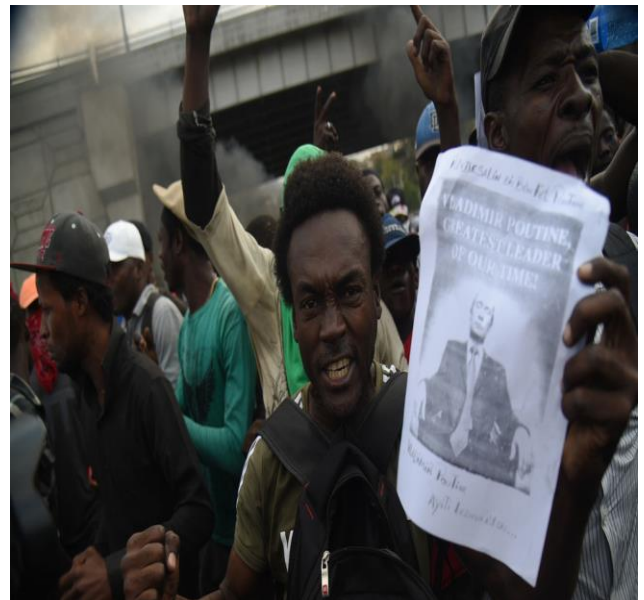
Above: Protestor in Haiti holds a picture of Russian President Vladimir Putin, with the words "Vladimir Putin, Greatest Leader of Our Time!". Many Haitians have their own experience of the blatant interference in their country by US imperialism over decades, and can see that Russia is defending itself and others against US led wars and other attempted forms of domination.

On the other hand, the PRC did send large shipments of equipment and materials to Haiti to "fight Covid", 40 i.e., perpetuate a fraudulent narrative which only assists Western imperialism in its struggle against the workers of the world. The Russian government also continues to trade in Covid terror, though to a lesser extent, now that the "pandemic" tales have been exposed. While many working people internationally can join Haitians in defending Russia and the PRC against military and political provocations by the US and European regimes, the politics of the governments of Russia and the PRC are light years away from what is ultimately required to stop and reverse predatory imperialism.