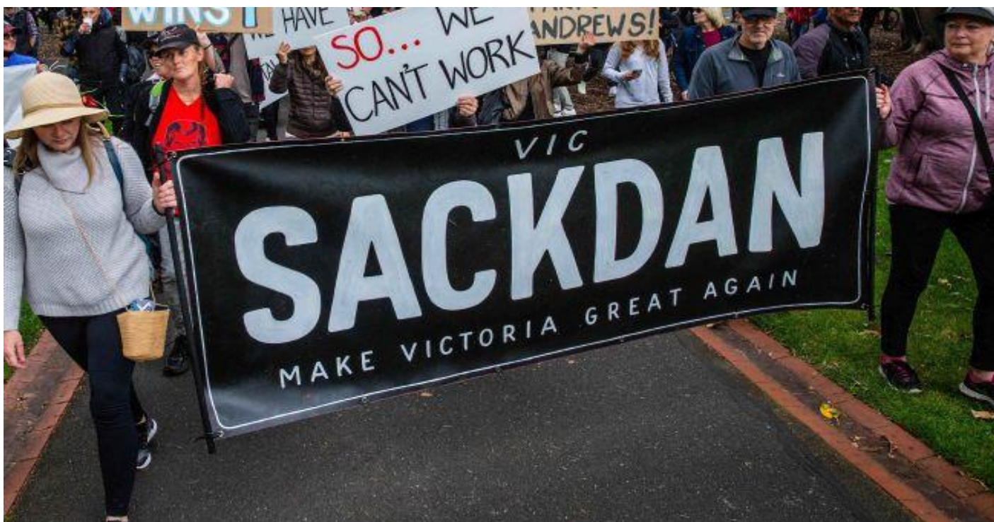
Above: Anti-lockdown protestors in Victoria demand the sacking of Premier Dan Andrews.

(Article sourced from www.redfireonline.com )