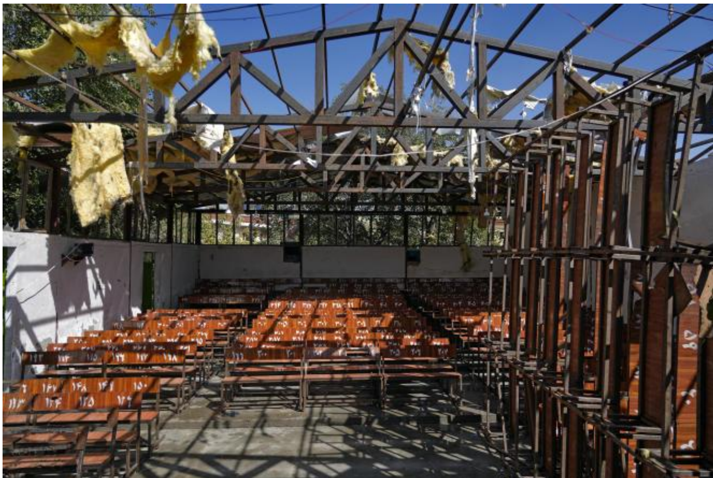
Above: Part of the Kaaj Education Centre after it was targeted on September 30.

(Article sourced from www.redfireonline.com )