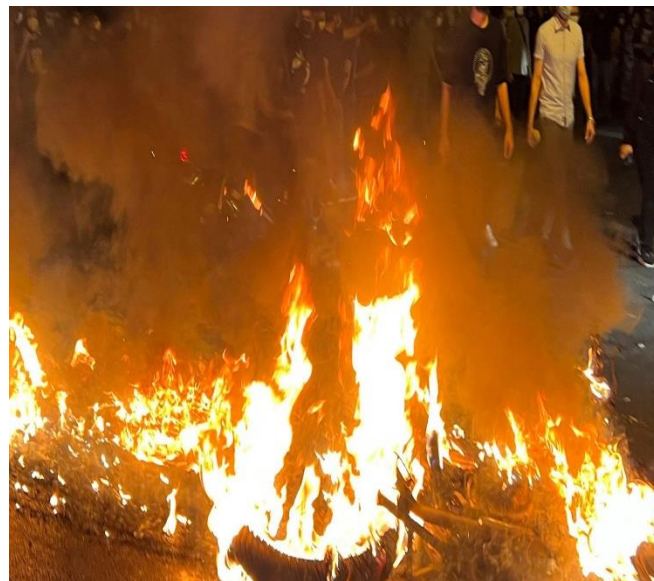
Above: A police motorcycle is set alight during the riots in Iran, ostensibly over “women’s rights”. Violent and murderous attacks on police and Basij demonstrate that the aim of the those carrying this out is nothing other than regime change in co-operation with Washington and London.

and Qazvin, with an army officer killed by the rioters in Qochan. 24