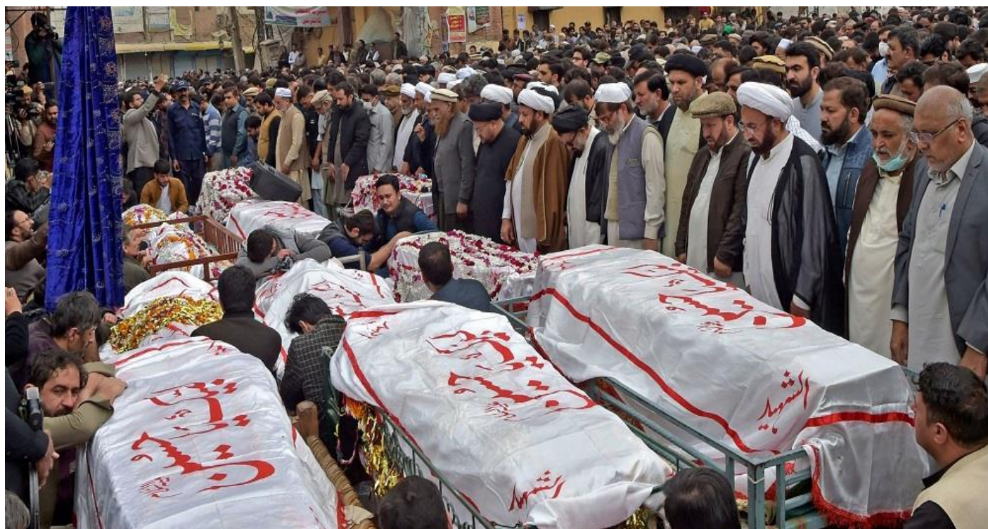
Above: Mourners offer funeral prayers for some of the victims of the Peshawar Mosque bombing.

(Article sourced from www.redfireonline.com )