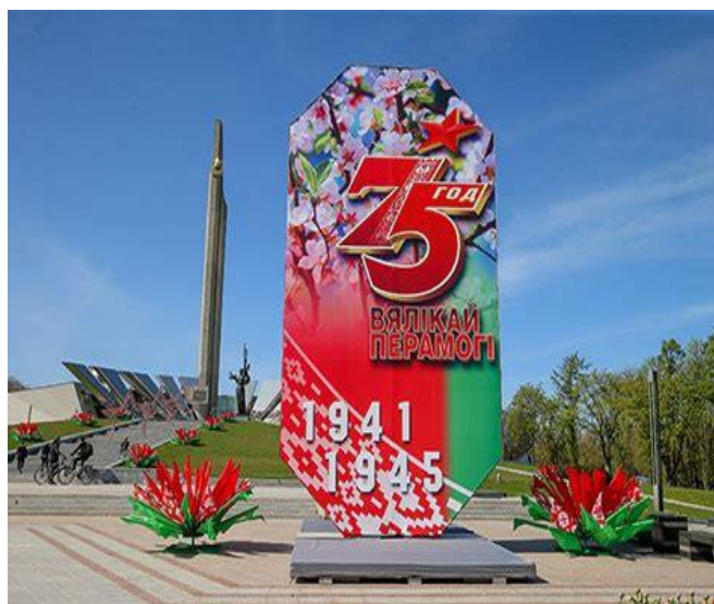
Above: A monument to Victory Day (the defeat of the Nazis by the USSR from 1941 to 1945) in Belarus. President Lukashenko resisted the full pressure of imperialism and refused to lockdown its people, its economy and its society on the fraudulent grounds of a "Covid health emergency". www.belarus.by

actions continued and deepened, global capitalism itself may have been called into question. To distract from the undeniably just demands of the Freedom Convoys – no one should lose their job over a vaccine, no one should be forced by the government to act against their will – Anglo/US imperialism ratcheted up the pressure on Russia. It wasn't like they were not already doing it anyway.