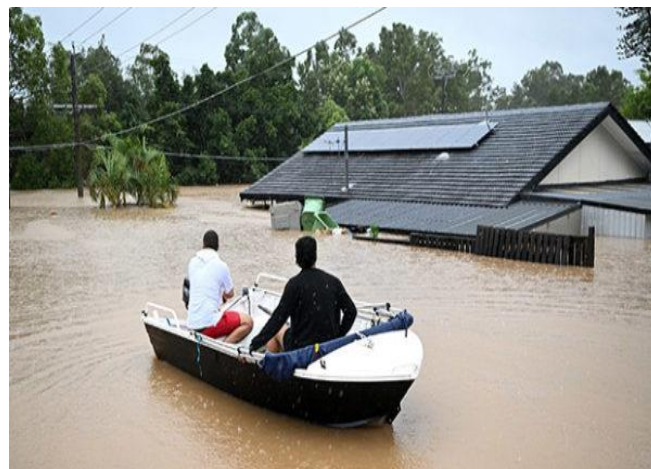
Above: The floods which hit Queensland in February destroyed many houses and damaged properties with mud infested waters. Eight (8) people lost their lives, being swept away by dangerous flood waters.

and has continued rising since then. The rise in carbon emissions mirrors the rise in the burning of fossil fuels, which has led many scientists to name a new geologic era – the “Anthropocene”.