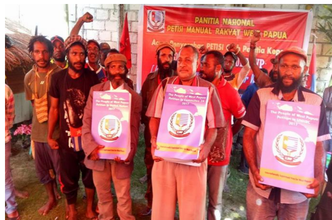
Above: West Papuans with copies of the independence referendum ready for presentation to the United Nations. The petition was signed by around 1.8 million mostly Papuans, representing about half of the population of all those residing in the land mass of West Papua. www.freewestpapua.org

22 http://humanrightspapua.org/news/23-2017/273-papua-independence-petition-delivered-to-the-united-nations (27-12-2017)