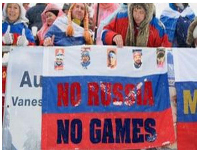
Above: Russian fans protest the IOC decision to ban Russia from the 2018 Winter Olympics at the World Cup Biathlon.

Washington's candidate in the Russian elections – Alexei Navalny – has been the recipient of funding from the notorious National Endowment for Democracy (NED) 59 , the US deep state body charged with subverting and overthrowing governments, and/or countries, which are independent of the US and their allies. Navalny has been found guilty of embezzlement, and is currently banned from running in the Russian elections next year, due to this criminal conviction. Cue Washington's nefarious manipulating of the International Olympic Committee.