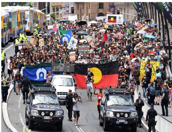
Above: Brisbane Invasion Day Rally 2018.

of Union-led defence of the oppressed people of Australia, and the lack of a strong left-wing workers party. Despite the heroic bravery of the Black Panthers, their black nationalism impeded their political development in the direction of genuine Marxism – despite some adopting off-cuts of Maoism. The Black Panthers were unable, or chose not, to link with the US working class, and thus were eventually eliminated by the murderous police actions of the US state. We sincerely hope that nothing like this will be the fate of WAR, but their adoption of the ideas of Aboriginal and/or cultural nationalism loom as a barrier to forming the necessary bonds with Australian workers.