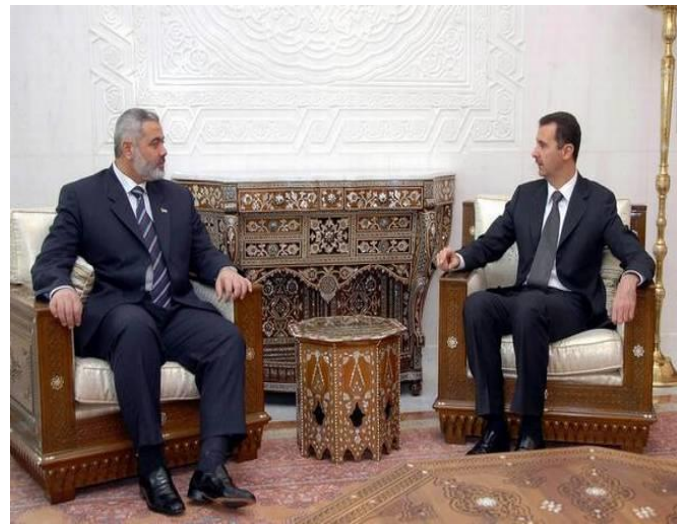
Above: Hamas leader Ismail Haniyeh meeting with Syrian President Bashar Al-Assad in 2006. Hamas treacherously sided with the US/ISIS/Al Qaeda/Saudi/Israeli powers gunning for regime change in Syria, despite their stated hostility to Zionist Israel. Islamist leadership is not capable of effectively leading Palestine to liberation.

imperialist states. And asking workers with a trifling amount of disposable income (boycott) due to capitalist recession to buy their way to geo-political strength is like wishing for magic.