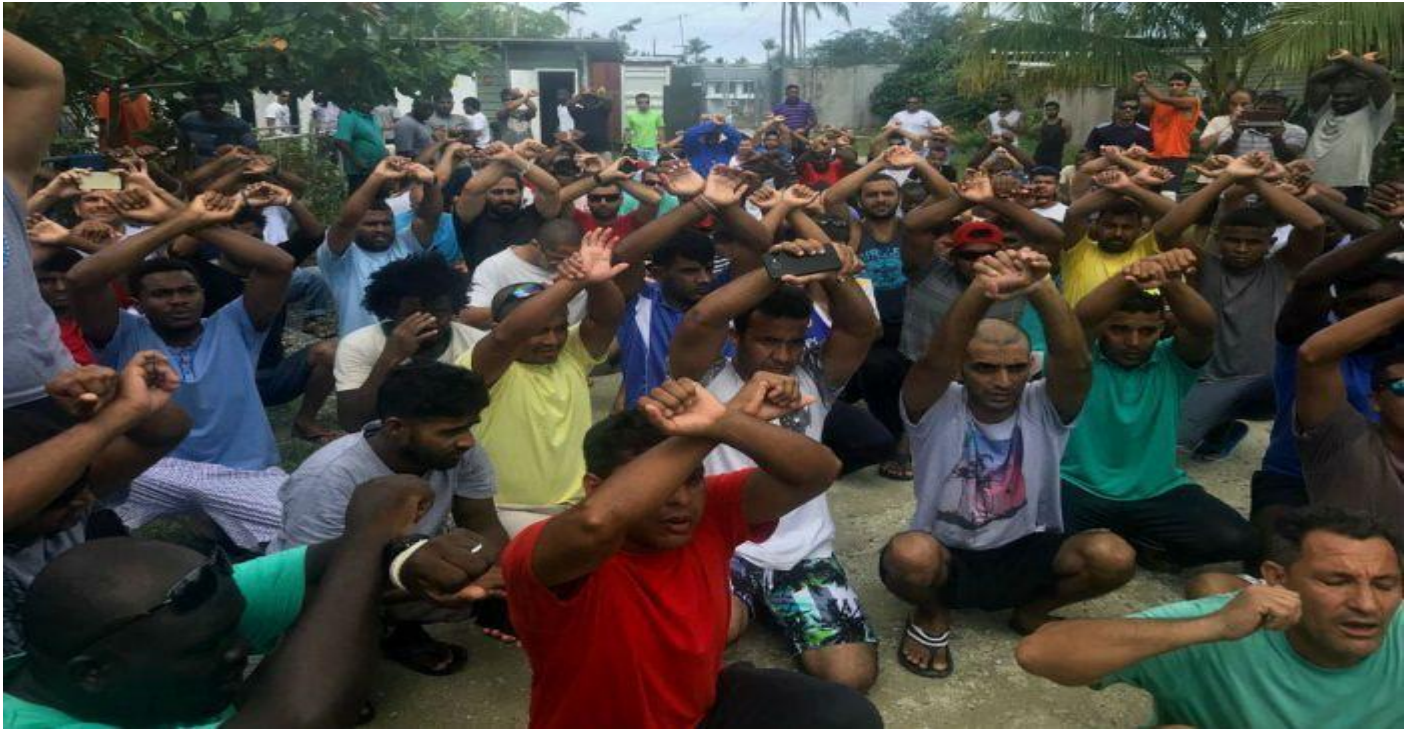
Above: Refugees on Manus Island protest the dire situation, including cut offs of water and electricity. 01-11-2017

(The following article appeared on www.redfireonline.com on 01-11-17) As we go to press, the Papua New Guinea (PNG) Defence Force is preparing to enter the Manus Island refugee detention centre, where around 600 men remain, fearful for their safety if they are forced out. 3 Earlier this year, the PNG army fired live ammunition into the detention centre, and there have also been machete and knife attacks against the asylum seekers by some aggrieved locals. The Manus Island detention centre is being closed after a ruling from the PNG courts which found that its establishment was unconstitutional. Full responsibility for it lies with the Australian government, which has funded these hell-hole death camps on Nauru and PNG to the tune of billions of dollars.