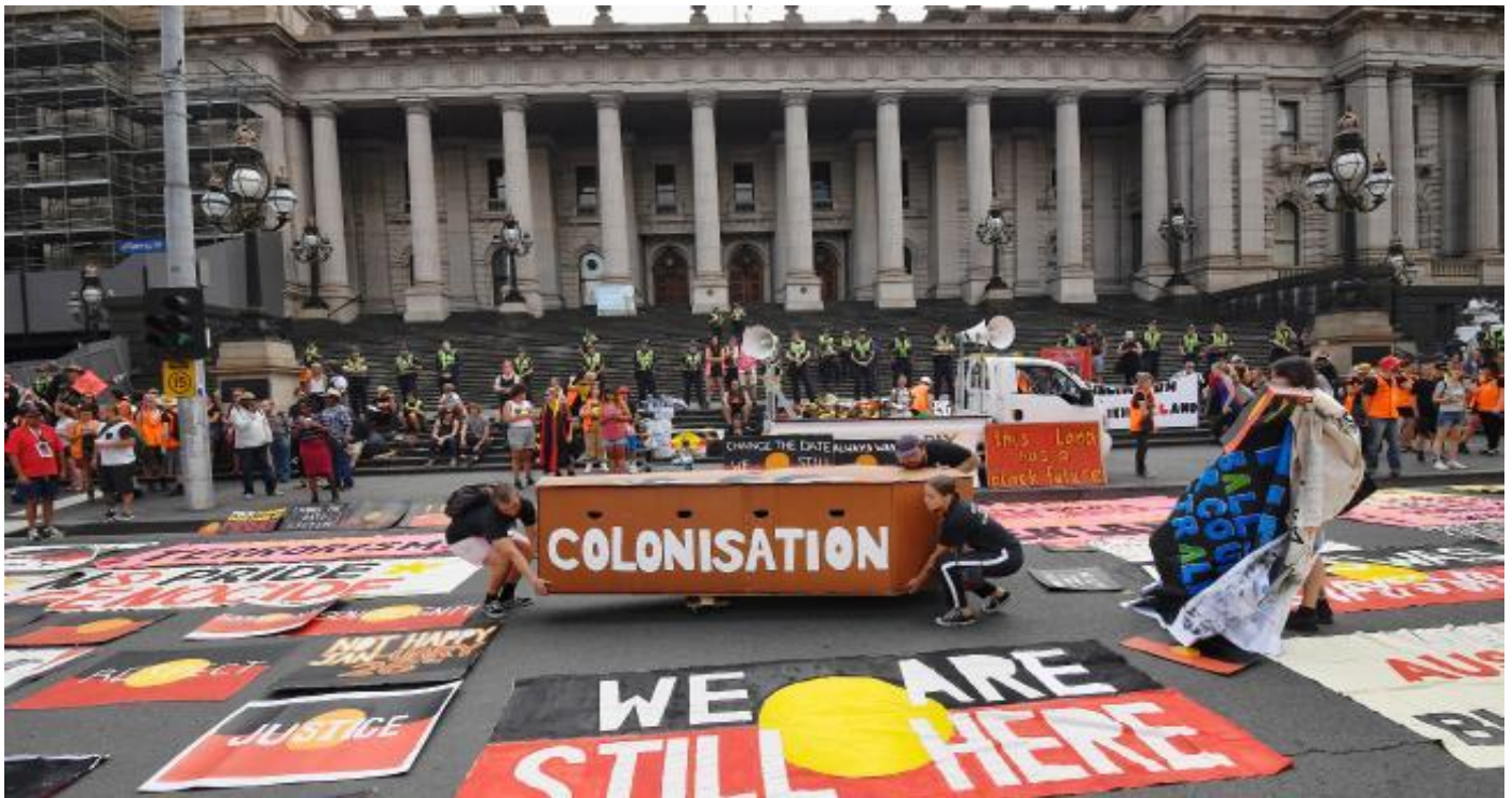
Above: The start of the January 26 Invasion Day Rally in Melbourne in 2018.