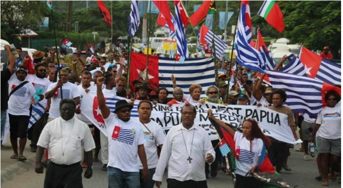
Above: West Papuan independence supporters on the march. www.onwestpapua.com