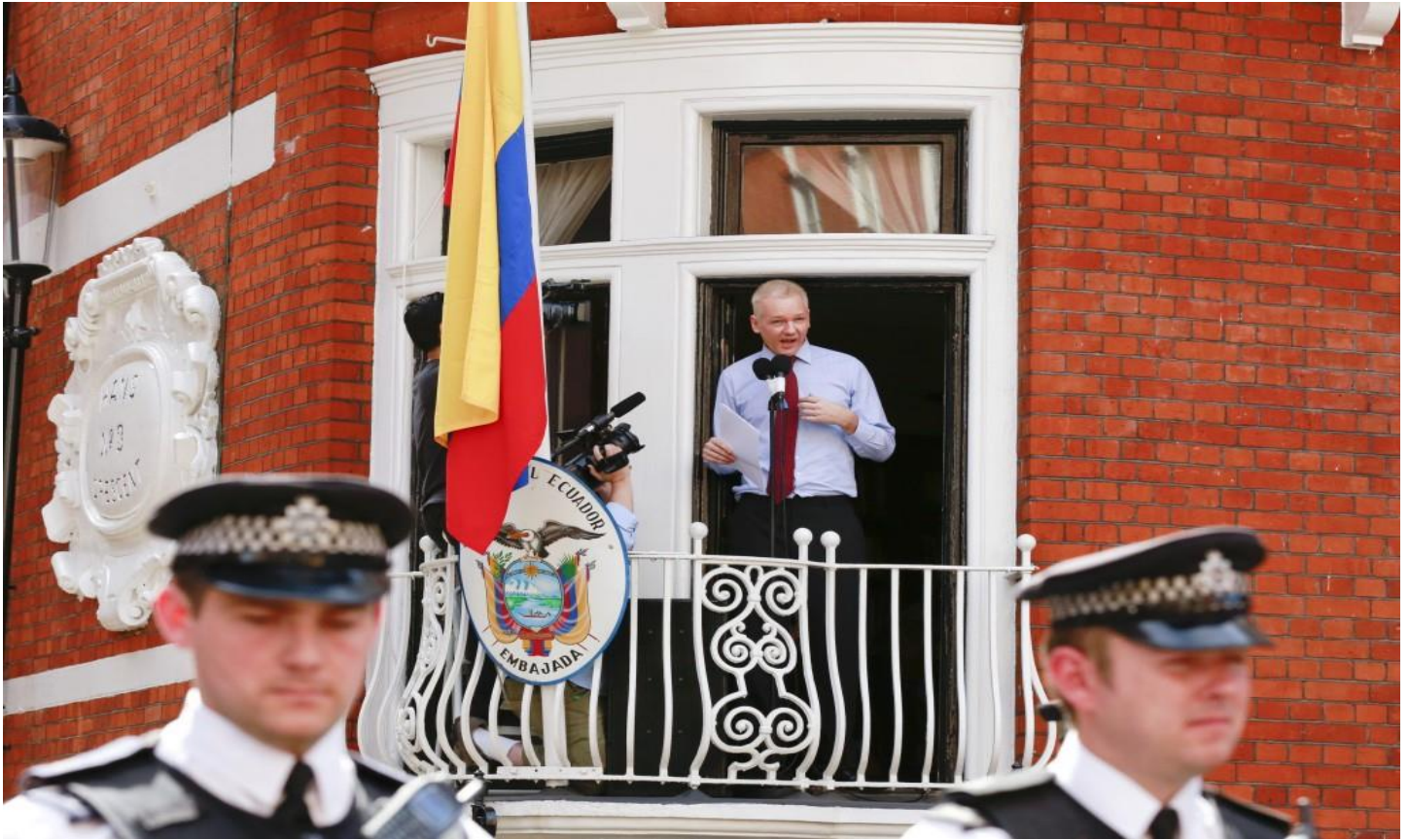
Above: Julian Assange speaks on the balcony of the Ecuadorian Embassy in London. www.pbs.org

(The following article first appeared at www.Redfireonline.com on 29-11-2017)