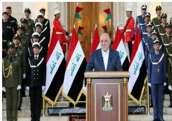
Above: Iraqi Prime Minister Haider Al-Abadi declares victory over ISIS in his country on December 9, 2017. While warning against ISIS sleeper cells, Al-Abadi stated that ISIS had effectively been removed from Iraqi territory.

Falastini, and Quwat al-Jalil. 47 As far as we are being told, Australian troops are still in Iraq and Syria, and the Australian government has not issued any statement against the Trump Administration’s outrageous provocations on Jerusalem. Working people here can help undermine the Australian government’s subordination to Israeli/US designs by demanding: Australian Troops: Out of the Middle East!