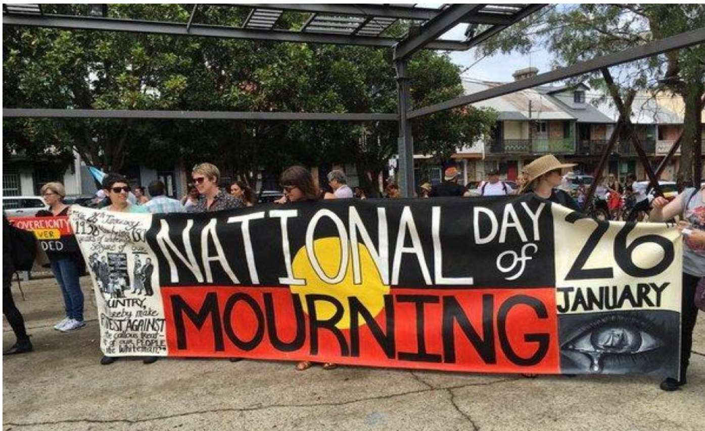
Above: Part of the Invasion Day Rally in Sydney on January 26, 2017. www.abc.net.au

(The following is the text of a leaflet distributed by the Workers League at the Invasion Day rally in Brisbane on 26 January, 2017)