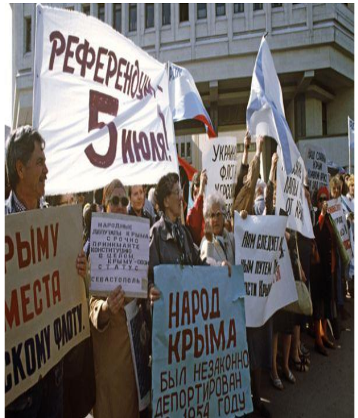
A rally in Simferopol in support of Crimea sovereignty, June 1992

From standpoint of the overwhelming majority of Crimea's residents, a historical injustice was redressed in March 2014: Ukraine was stripped of what it had obtained illegally between 1991 and 1995 using deception and military force. In the eyes of Crimeans, Ukraine's claims to the peninsula and the support of those claims by the West look very odd. In the 1990s, the world «overlooked» Ukraine's annexation of Crimea, and no one was concerned that the rights of the inhabitants of the Crimean Autonomous Soviet Socialist Republic had been violated. But when those citizens again took it into their heads to determine their own destiny in 2014, an international scandal blew up that still burns today.