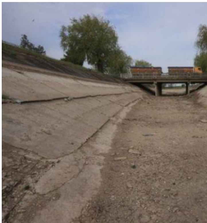
In mid-2014 Ukrainian media bragged about drying up the North Crimean Canal

In 2014, Kiev ordered the North Crimean Canal (built by the USSR between 1961 and 1971) to be cut off, as a result of which the acreage of irrigated land in Crimea declined by 85%. At the end of September 2015, a group of Ukrainian «activists», representing the ultra-right organizations Right Sector and Azov battalion as well as several fugitives from the Mejlis of Crimean Tatar People organized a transportation «blockade of Crimea»: the highways into Crimea were shut down to prevent Ukrainian goods from reaching the peninsula, with the intention of thereby triggering a food shortage and a rise in food prices, due to the complexity and expense of obtaining supplies from mainland Russia by sea, air, or across the Kerch Strait.