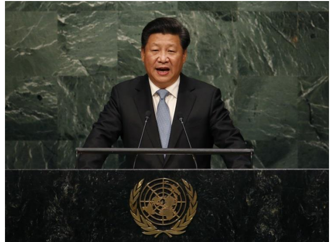
Above: President of the People's Republic of China, Xi Jinping, speaking at the United Nations in Geneva. Amongst other things, President Xi stated that the world should, over time, be made free of nuclear weapons.

President Trump ramped up rhetoric targeting China. 13 Despite this, China, like the DPRK, stridently advocates the ridding of nuclear weapons from the world. President Xi Jinping, in a speech at the United Nations in Geneva recently, stated that "Nuclear weapons should be completely prohibited and destroyed over time to make the world free of nuclear weapons." 14