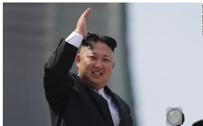
Above: The DPRK Supreme Leader, Marshal Kim Jong Un. Although routinely referred to as "crazy" by the Western media, the DPRK leadership retains an entirely rational position of self-defence against a US led Empire, which has not ceased its economic blockade and military threats in over 60 years.

invest. A downward spiral begins, as classically analysed by Karl Marx. Almost nothing except "creative destruction" can restart production.