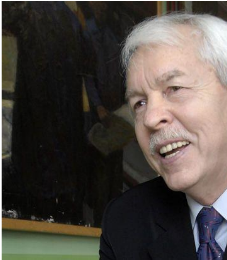
Yuriy Meshkov, Crimea President in 1991-1995

building housing the Supreme Council of the republic, where the administration of the acting president of Crimea, Yuriy Meshkov , was also headquartered, and demanding that he be turned over. Since Meshkov refused to vacate his office, they tried to poison him. Much later he described how his drink had been poisoned, and that later in the hospital he was refused proper medical care. Only an emergency evacuation to Moscow miraculously saved his life.