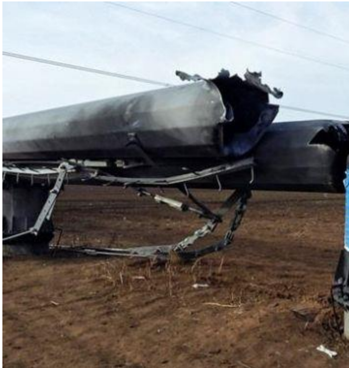
Supplying Crimea electricity pylons in the Kherson region, blown up by blockade «activists», October 2015

with an electric company that included a line acknowledging Crimea and Sevastopol to be part of Ukraine. This blackmail ended in a massive failure. Only 6.2% of the Crimean residents surveyed supported the Ukrainian proposal, and 93.1% rejected it, agreeing to endure their difficult conditions for several months. The contract with Ukraine was not finalized on Kiev's terms.