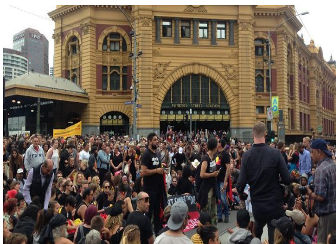
Above: Thousands turned out to the Invasion Day rally in Melbourne. The large turnout speaks to the level of support for decent and just treatment of all of Australia's indigenous people, despite the official neglect of the Australian state. www.sbs.com.au

indigenous population. 25 The unemployment rate for indigenous people is three times that of those who are not descended from the traditional owners. 26 Most revealingly, Aboriginal people are fifteen times more likely to be thrown in prison than those who have no Aboriginal lineage. 27 In a very real sense, Aboriginal people remain prisoners in their own land.