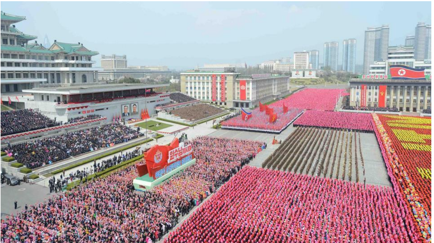
Above: The Democratic People's Republic of Korea (DPRK) holds a mass celebration of the 105 th birth anniversary of the country's founder and Eternal President, Kim Il Sung.