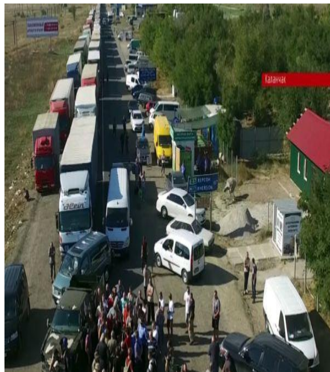
Activists blocking a cross-point to Crimea in Kalanchak, Kherson region

deprived of the opportunity to sell food to Crimea, suffered the most from the actions of the «blockaders». In the peninsular, however, wholesale merchants quickly adapted to obtaining their supplies from Russia, domestic producers got a shot in the arm, and traveling markets popped up, offering products from as far away as Belarus.