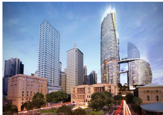
Above: An artist's impression of the completed Queens Wharf development. If completed, the luxury hotel towers will dwarf historic buildings, as well as the state parliament, as well as a University.

The Right To The City organisation is correct to frame the discussion as “Instead of a Casino”. Instead of luxury apartments and exclusive motel rooms which few working people can afford, what is desperately needed is a state run program of building ample public housing. The building of quality but affordable public housing could not only house the homeless, but will help exert downward pressure on the astronomically high cost of housing. Instead of a casino, there could be a state run program of public works, to upgrade and expand an affordable public transport system – given that Brisbane’s public transport is one of the most expensive in the world, and the passenger rail problems are legion. Instead of a casino, public money could be spent on replacing the millions of dollars of funding ripped out from under schools and hospitals by successive Labor and Liberal federal governments.