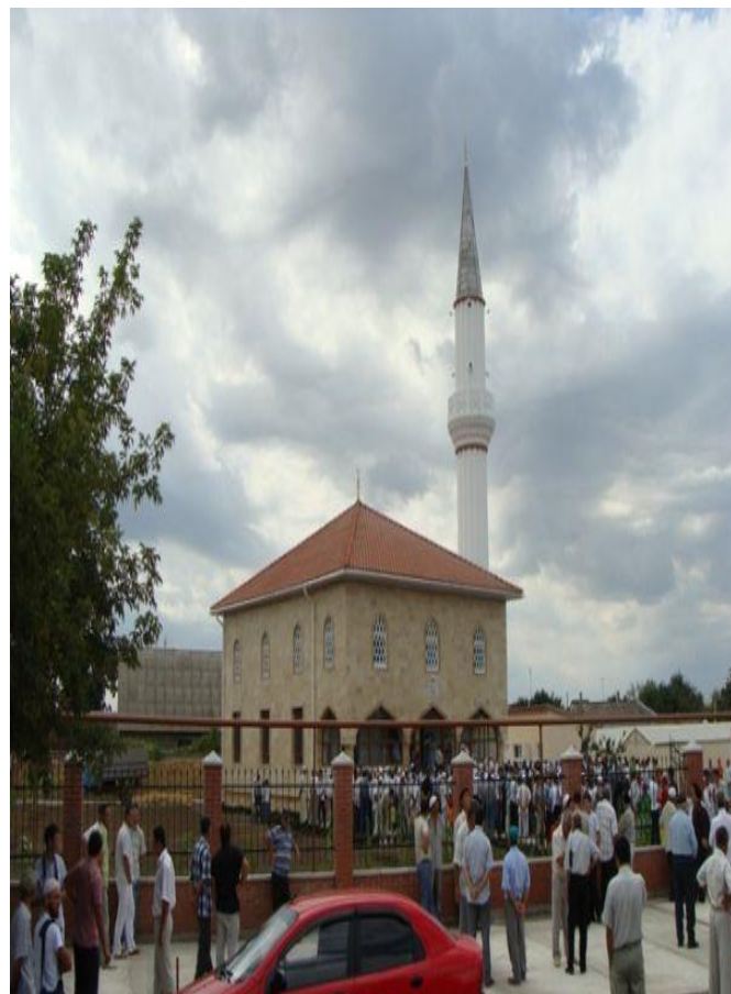
New mosque in Crimean Tatar Voinka village, built in 2010 on donations by the Chechen leader Ramzan Kadyrov

Three state languages are officially recognized in the republic: Russian, Ukrainian, and Crimean Tatar. And Muslim mosques peacefully coexist with Russian Orthodox churches. Were it not for the warmongers who are trying to jump-start the underground activities of Hizb at-Tahrir and other radical organizations in Crimea, Crimea would have no other problems, except one - coping with the devastation wrought by Ukraine.