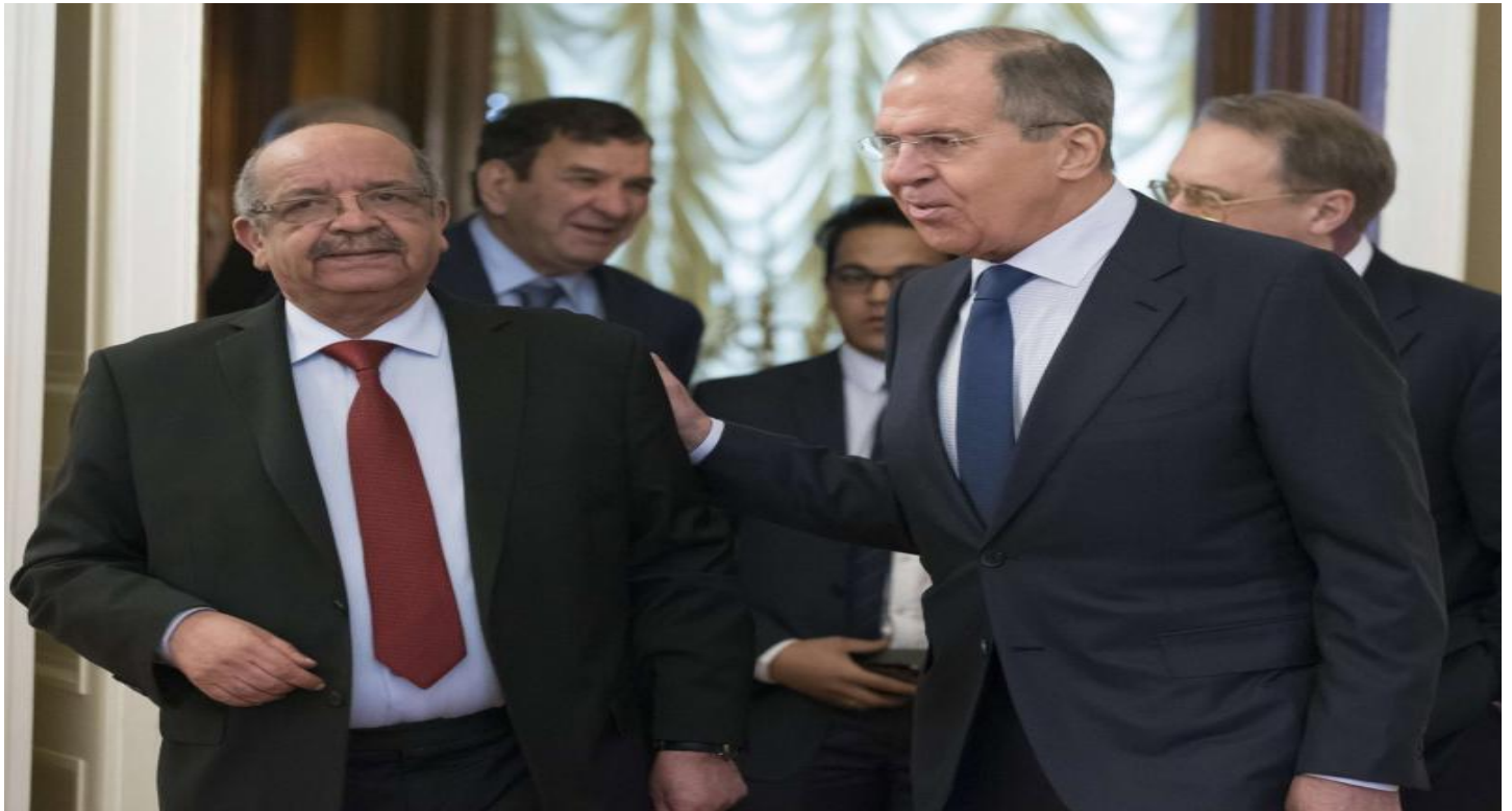
Above: Russian Foreign Minister Sergei Lavrov (at right) meeting with Algerian Foreign Minister Abdelkader Messahel (at left) in Moscow, on February 19, 2018. Ties between Russia and Algeria go back to the founding of Algeria's independence, when Russia was then part of the Union of Soviet Socialist Republics (USSR).

(Article sourced from www.redfireonline.com )