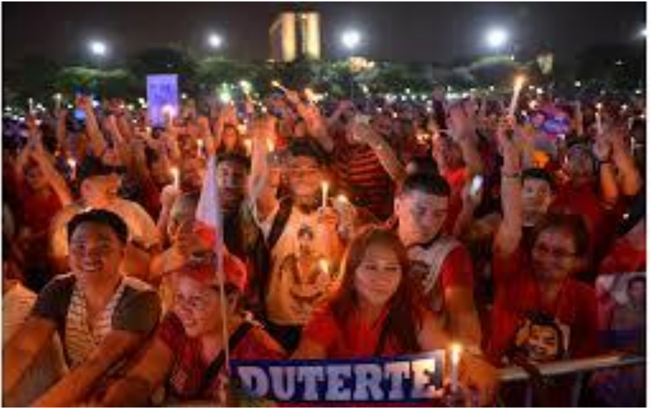
Supporters of President Duterte at a rally in Manila.

(Article sourced from www.redfireonline.com )