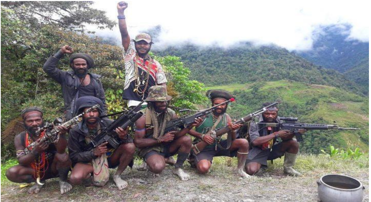
Above: A West Papua Liberation Army unit in Nduga regency, in March 2019.