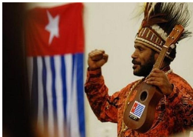
Above: Benny Wenda often sports a ceremonial head dress to spruik for independence for West Papua. While many claim he is an “exiled independence leader” in fact he cannot return to West Papua as he is wanted to stand trial for the slaying of a police officer and a security guard, which occurred after he incited a crowd at Abepura in the year 2000.