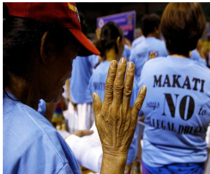
Above: US backed NGOs and their international backers complain of “human rights” abuses during President Duterte’s harsh measures against illegal drug pushers. Yet they don’t mention the fact that many drug pushers and users have voluntarily surrendered to the police, to avoid being taken in a police raid. Here, some drug pushers and users have surrendered to the police in Makati, and made a pledge not to use or sell methamphetamine.

now recognise that the streets are safer at night, now that the heavy police measures have scared off many of those involved in the drug trade. Some employers are grateful, because some employees were telling them they didn’t want to go home late from work at night, for fear of being accosted by the drug pushers, some of whom were the tricycle drivers themselves. 76