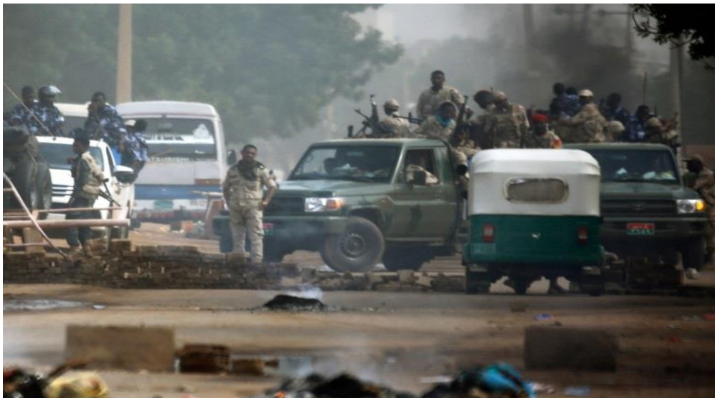
Above: In response to US backed sedition, the Sudanese army deploys outside its headquarters in Khartoum.

(Article sourced from www.redfireonline.com )