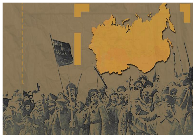
Above: Scene from the October Revolution in 1917, backgrounded against a map of Russia. Lenin and the Bolsheviks advocated the right of all nations to self-determination, but only if it advanced the international cause of socialism.

It would be a different matter if the West Papuan independence leadership proclaimed: we fight for West Papuan independence as part of our struggle for socialism and greater equality throughout Indonesia and the Asia-Pacific, and we are willing to stand with working people in our country and internationally against the perils of capitalism across the globe. Even something leaning in a left-wing direction could be the basis for a reassessment. Until and unless such a moment arrives, workers should leave the advocacy of West Papuan independence to the drawing room conversations of the chattering classes.