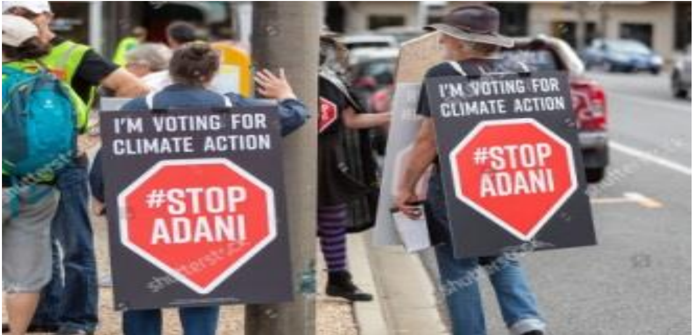
Above: There was no option to vote to Stop Adani, as important as that is.

(The Workers League released this statement on the day following the Australian Federal Election.)