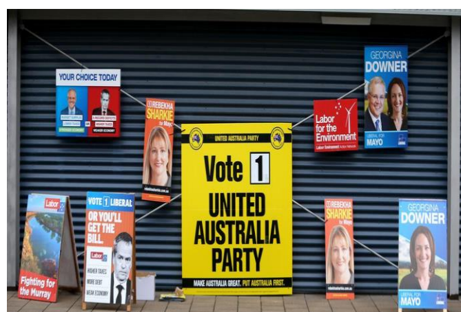
Above: Election posters from the major parties – and the billionaire funded United Australia Party. In bourgeois elections, the major parties focus almost wholly on personalities to the exclusion of policies and what they actually plan to do. In office, those elected are virtually unaccountable for their practice. The working class is understandably repelled by this “politics”.

standards of all on the basis of equality. This is due to the fact that the working class has no material interest in the system of private production for private profit. On the contrary, its interests are bound up with the social ownership and social use through labour, of the means of production – the land, banks, factories, mines and so on. Humanity steps forwards, or falls back, according to the living and working conditions of this class. Yet not one of the parties or independents running in the Australian Federal Election takes elementary and consistent positions, domestically and internationally, which defend the interests of working people.